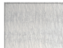
CORRECT APPLICATION = 20 dry gms/sqm