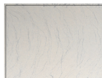
COVERAGE TOO LIGHT